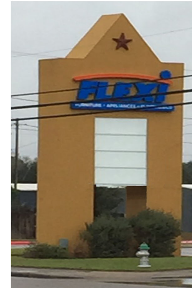
EXISTING PYLON SIGN